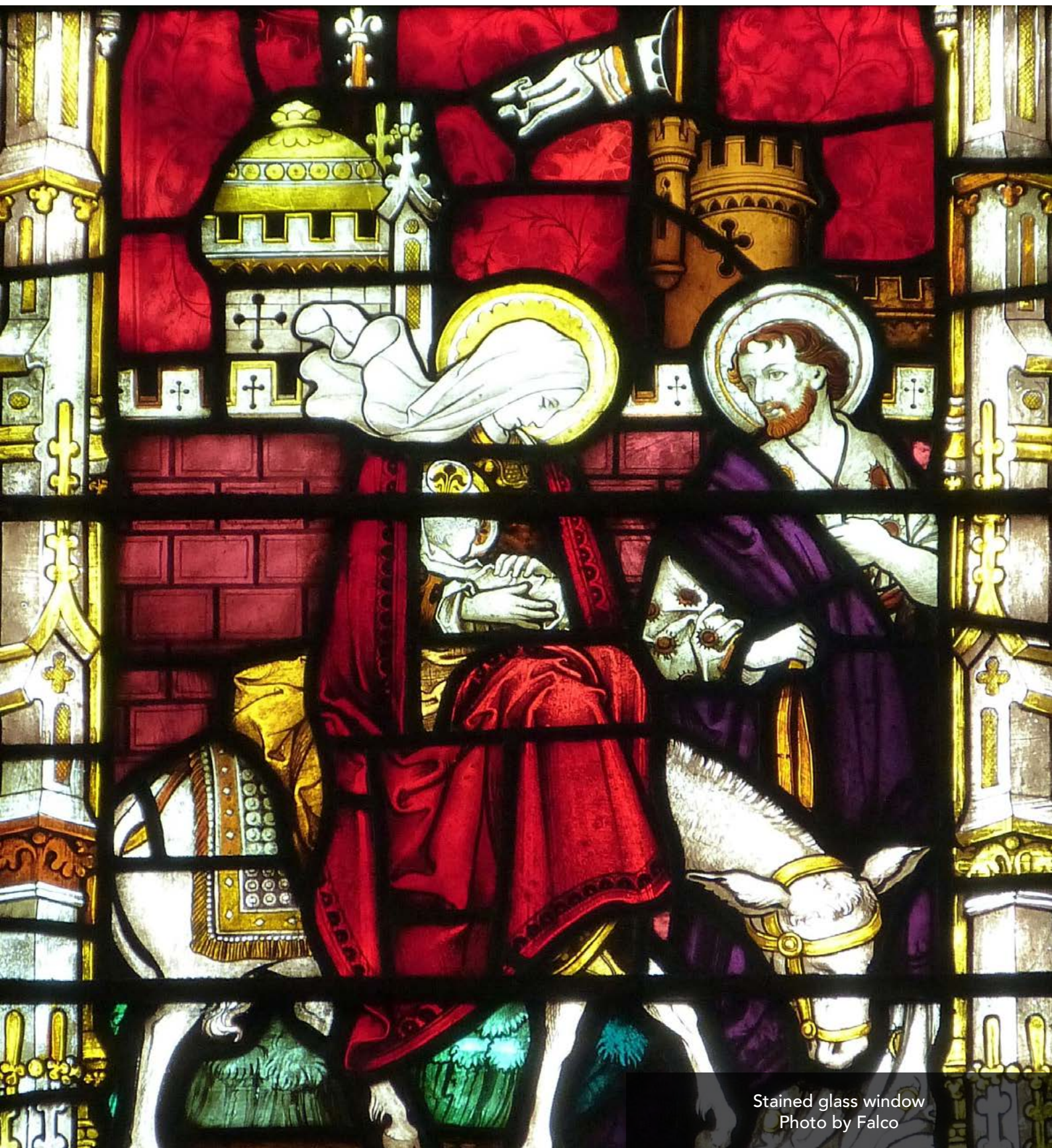
Stained glass window